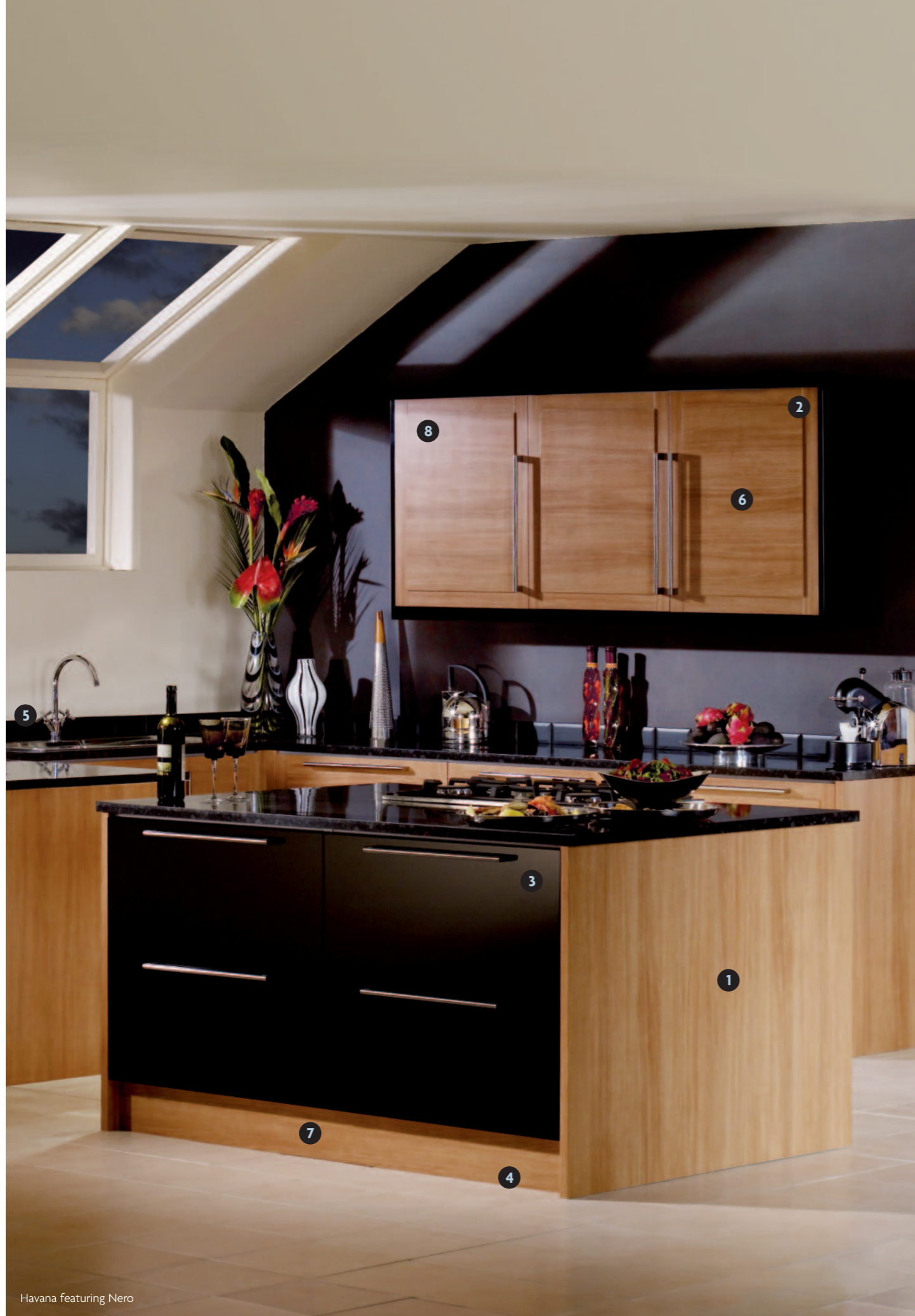
Havana featuring Nero